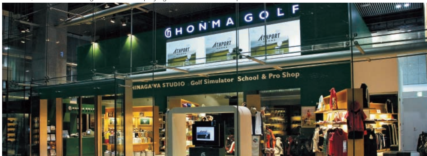
Three 120-inch wide rear projection screens cover the wall of the high-ceilinged showroom

technology, and a full lineup of golf apparel, It also serves as a "broadcast center" transmitting all kinds of golf-related information. The wide-screen projections made possible by three Panasonic PT-D5700L DLP® projectors are essential to this innovative golf emporium.