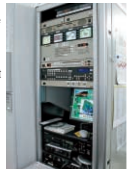
The delivery rack sits in a corner of the store's office. Here, the store's own images can be easily created on a PC.

On weekdays, Shinagawa Studio opens at 10 a.m. and closes at 9 p.m. "We keep the images projected on the screens all day, every day," says Mr. Hamasaki. Outside of days when special events take place, images are projected every day for eleven hours. "Except for having to exchange the lamps, which is to be expected, we've had no problems and the picture is as crisp as ever." With a dual-lamp optical system, the picture doesn't disappear even if one lamp burns out—a setup ideal for operation over extended periods of time. Also, because the surrounding area is a new business district, the ability to deliver information to the public in the evening is priceless. "The screens can be seen quite clearly from the Shinagawa Intercity complex across the way, and they help to bring all kinds of new customers into the store," says the store manager. "Our data show that we get more customers from outside the trading zone than we had expected, including a surprisingly high percentage of young people." It's the innovative nature of the store that's responsible for attracting a wider range of customers, but we'd like to believe the giant wide-screen projections play a role in leading them to the store's door.