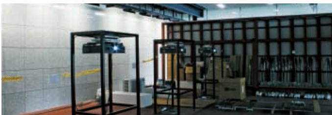
Three PT-D5700L projectors are installed behind the screen.