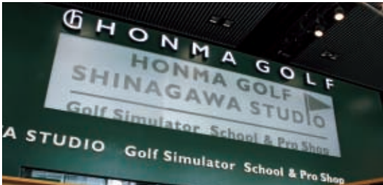
A wide screen made possible by edge blending that seamlessly links the three screens