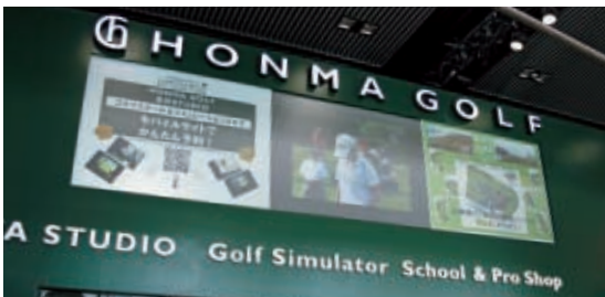
Different images can be projected on each of the three screens

With three side-by-side rear projection screens, it is possible to project different images on each of the three screens, or one wide image on all three at once using edge blending.