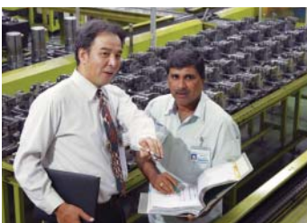
Matsushita's energy-saving activities in Malaysia have won approval as CDM projects from the United Nations

Coexistence with the global environment is one of Matsushita's corporate visions for the 21st century. Matsushita strives to create "new value for living" by minimizing environmental impact while improving customer quality of life with its products. The Company is thus promoting environmental management based on its Green Plan 2010, a global environmental action plan with targets to be achieved by 2010. And under a new symbol called "eco ideas," representing Matsushita's commitment to achieving environmental global excellence, the Company will roll out a number of groundbreaking environmental initiatives.