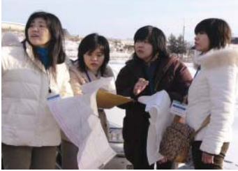
Matsushita employees involved in activities to locate remaining FF-type kerosene fan heaters in cold regions of Japan