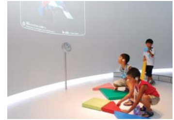
RiSuPia in the Panasonic Center Tokyo