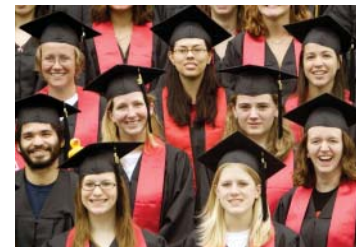
Use of the Astro Vision screen was donated to Gallaudet University to air a public service announcement