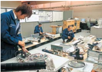
A practical test bed for product recycling