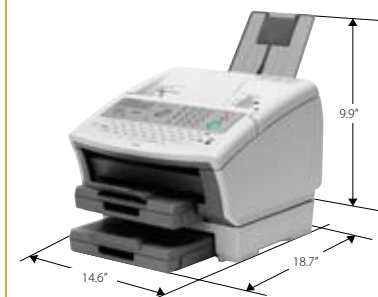
2nd Paper Feed Module optional